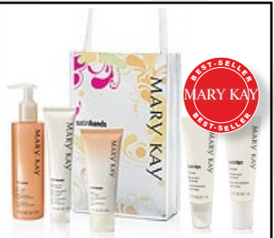
Set 8 - $53 Satin Set: Satin Hands Set & Satin Lips Set