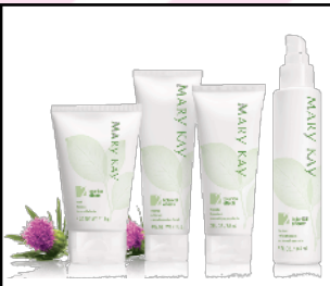
Set 5 - $58 Mary Kay Botanical Effects Skin Care Set: Cleanser, Freshener, Mask, and Moisturizer in 1 of 3 formulas