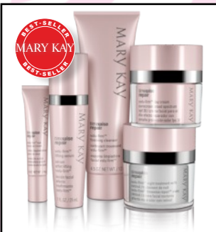
Set 1 - $205 TimeWise Repair Volu-Firm Set Foaming Cleanser, Lifting Serum, Day Cream SPF 30, Night Treatment w/ Retinol, Eye Renewal Cream