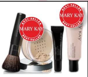
Set 7 - $60 Keep It Simple Set: Mineral Powder Foundation & Brush, Concealer, & Foundation Primer