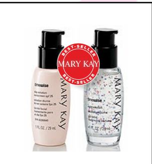
Set 3 - $64 Protect & Defend Set: TimeWise Day & Night Solutions