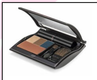
Set 9 - $74 Basic Color Set: 3 mineral eye shadows, 1 mineral blush, 1 lipstick/gloss, Mary Kay Compact, & applicators