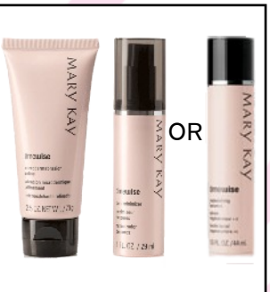
Set 4 - $55 Softer You Set: TimeWise Microdermabrasion+ Set (Refine & Pore Minimizer) OR Replenishing Serum+C