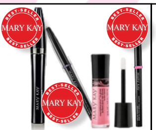
Set 10 - $54 Finishing Set: Eye Liner, Ultimate Mascara, NouriShine Lip Gloss, & Lip Liner