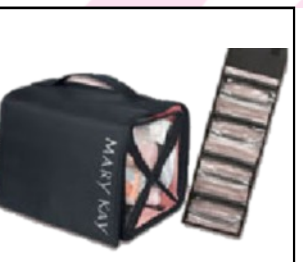
Set 11 - $35 Travel Roll-Up Bag 4 detachable zippered pockets rolled up into a convenient handled bag