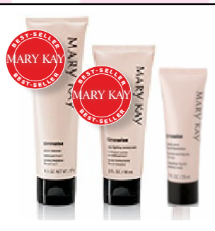
Set 2 - $66 Basic TimeWise Set: TimeWise Cleanser, Moisturizer, & TimeWise Liquid Foundation